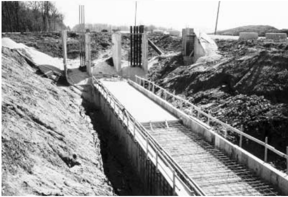
Workers pour the final bucket.

The ceiling of the Main Injector tunnel awaits the last pouring of concrete.