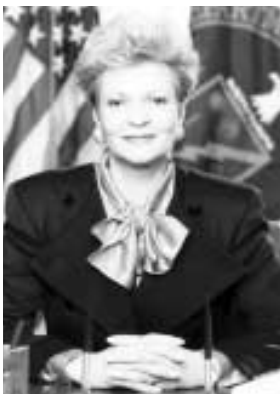
Secretary of Energy Hazel O'Leary