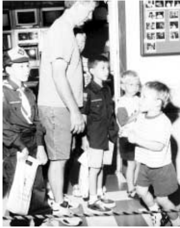
Cub scouts explore the Main Control Room.

A family strolls through Fermilab's restored tallgrass prairie during the Open House.