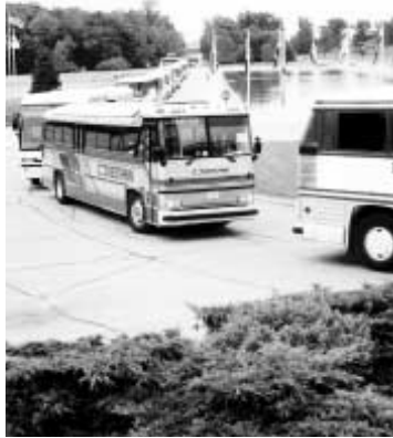
Fifty buses carted guests around the 6,800-acre site.