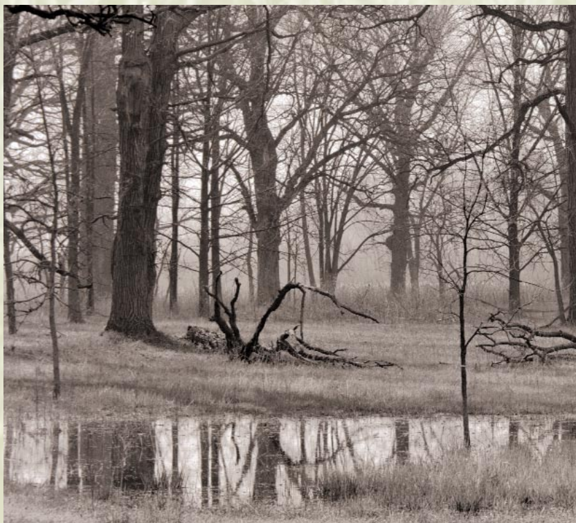
Sprouts of rare marsh betony, left; spring pools, above; oak buds, right.